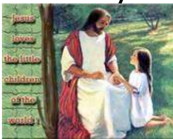
Testament Travelers Sunday school (Pre-K – 5 th Grade)