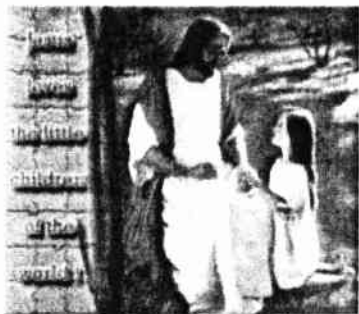
Sunday School Testement Travelers (Pre-K – 5 th Grade)