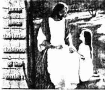
Sunday School Testament Travelers (Pre-K – 5 th Grade)