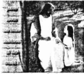
Sunday School Testament Travelers (Pre-K – 5 th Grade)