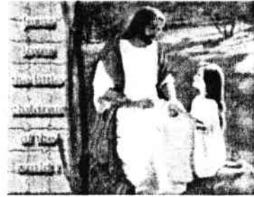
Sunday school (Pre-K – 5 th Grade)